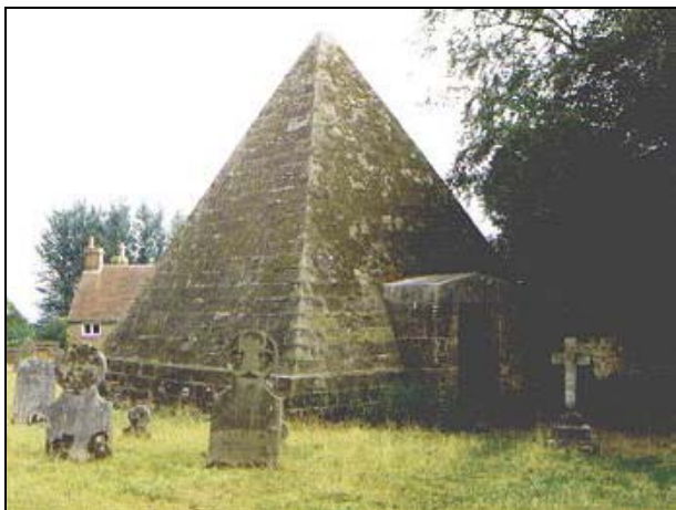
Jack Fuller's Pyramid Mausoleum, Brightling Church

Writing in her first book Follies and Grottoes , Barbara Jones described the scene at Brightling, saying: The atmosphere of follies is beyond dispute, but alas, also beyond analysis. At Barwick the unfamiliar shapes of the follies seem responsible, but Mad Jack Fuller's follies in Sussex immediately confound so simple an answer. True, he had no grotto, but he had a cone, a pyramid tomb, an obelisk, a hermit's tower, as well as much more normal adornments to an estate as an observatory and a rotunda (by Robert Smirke), and yet it is all jolly, one cheerful piece of nonsense after another, quite without alarm.