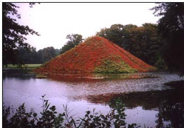
The Sea Pyramid at Branitz, East Germany

T he new edition of Historic Gardens Review includes an article on Prince Hermann von Pückler Muskau, and his gardens at Muskau and Branitz in what used to be East Germany. There is also an article on Alton Towers as well as the usual collection of fascinating news and features on historic parks and gardens from around the world. Details from The Historic Gardens Foundation www.historicgardens.org