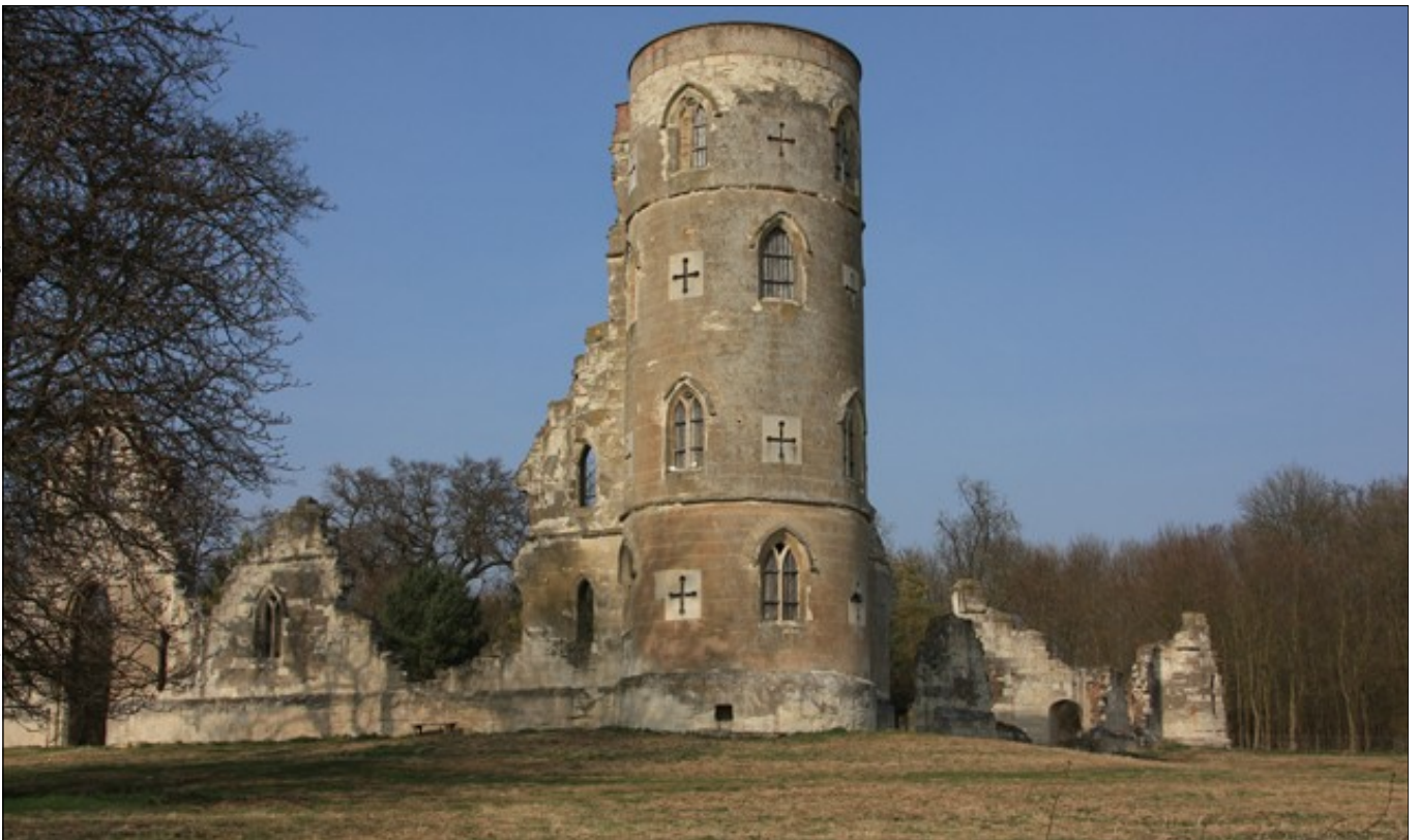
The Sham Ruin at Wimpole Hall, Cambs.