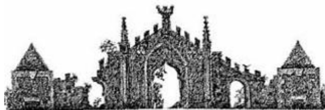
The Jealous Wall at Belvedere House, Co. Westmeath.