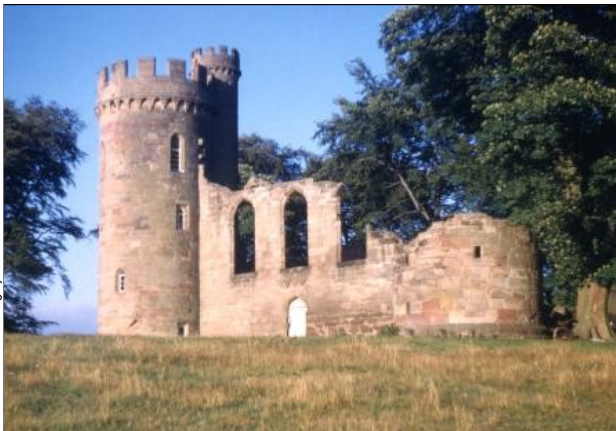
The Ruined Castle at Hagley.

Naturalisation, chiefly by ivy, was a key element in achieving the 'sham', implying that nature herself was one of its architects. When William Chambers built his Ruined Arch at Kew in 1760, an unsigned contemporary account speaks of how the 'briars and other wild plants...[merge with]...a quantity of fragments spread over